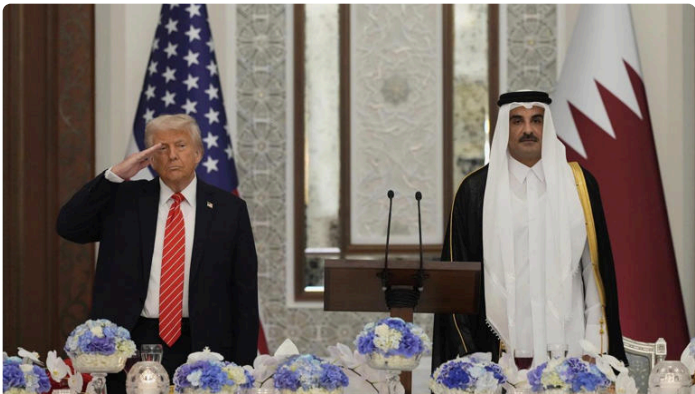
Trump secures USD 1.2 trillion US-Qatar deal spanning aviation, energy

US President Donald Trump announced several agreements with Qatar valued at over USD 243.5 billion, alongside a broader economic exchange worth at least USD 1.2 trillion. Signed during a visit to Qatar, the deals include sectors from aviation and energy to defence and quantum technology. Highlighting a landmark Boeing-GE Aerospace sale to Qatar Airways--Boeing's largest-ever widebody order--the agreements are expected to support over 1 million US jobs and deepen strategic cooperation between Washington and Doha. The White House released a statement on Wednesday stating, "Today in Qatar, President Donald J. Trump signed an agreement with Qatar to generate an economic exchange worth at least USD 1.2 trillion. President Trump also announced economic deals totalling more than USD 243.5 billion between the United States and Qatar, including a historic sale of Boeing aircraft and GE Aerospace engines to Qatar Airways."